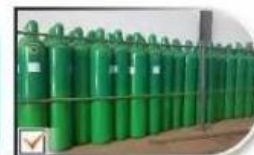
1. Cylinder Surface Inspection & Treatment