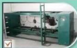
Inner Rust & Polish