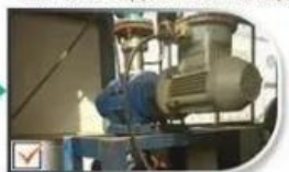
2. Tightness Inspect