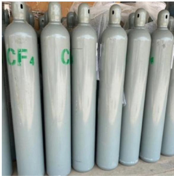
Packaging & Shipping